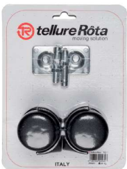
Black polyamide 6 wheels Package with 2 pieces and 4 fittings