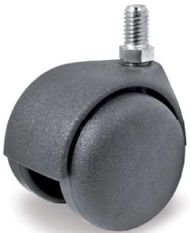
Black polyamide 6 wheels