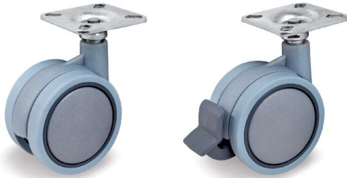
Grey polyamide 6 wheels