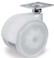
Transparent polypropylene wheels