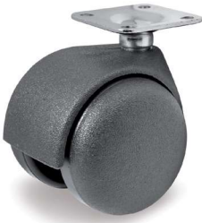
Black polyamide 6 wheels