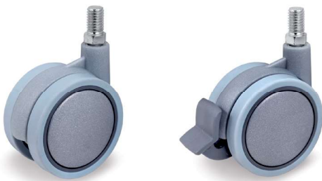
Grey polyamide 6 wheels